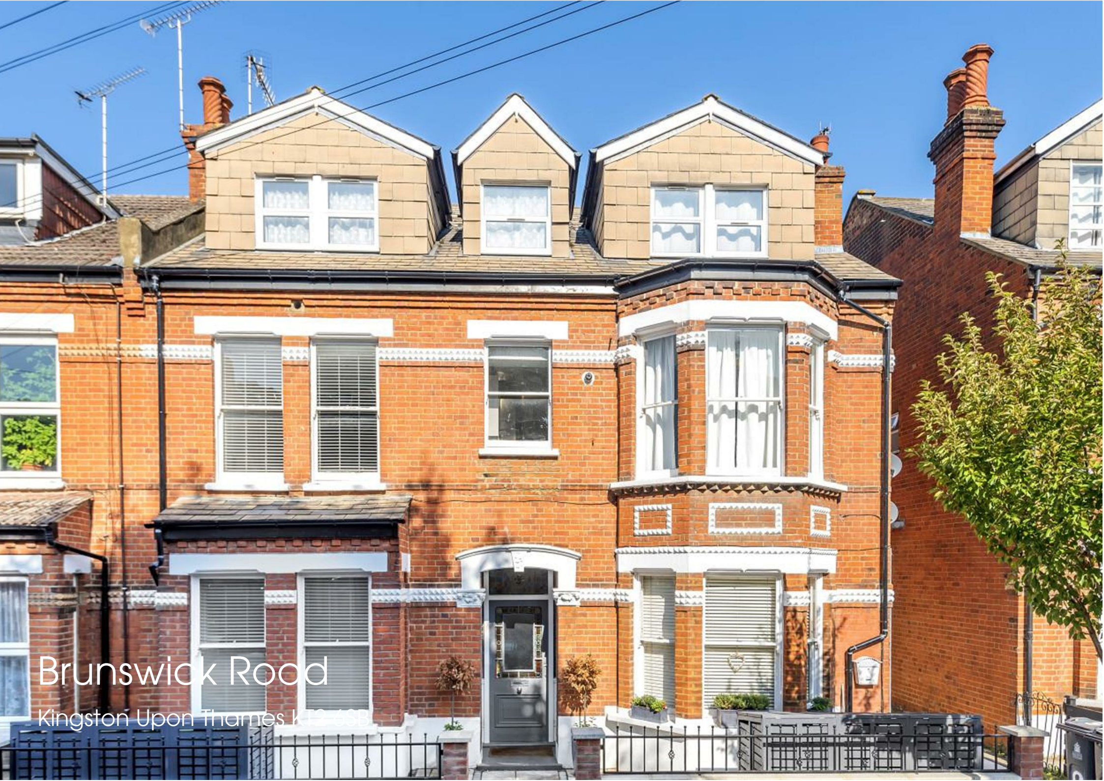
Brunswick Road Kingston Upon Thames KT2 5ED